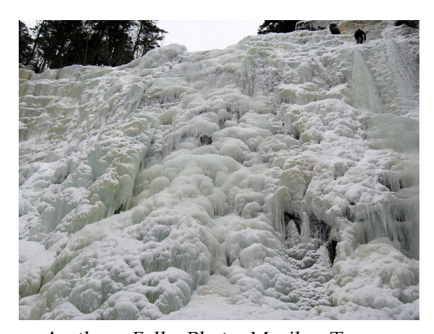
Arethusa Falls