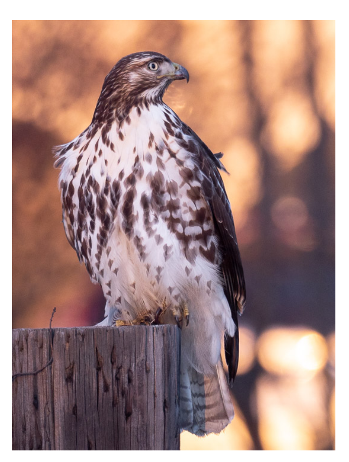
I must be off