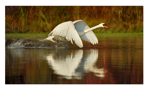
Taking off; Photo, Doris Monteiro

Doris Monteiro offered a collection of photos taken while kayaking on our local waters, including the Sudbury and Assabet rivers. The floral images proved the utility of the kayak for getting close to the subject and filling the frame.