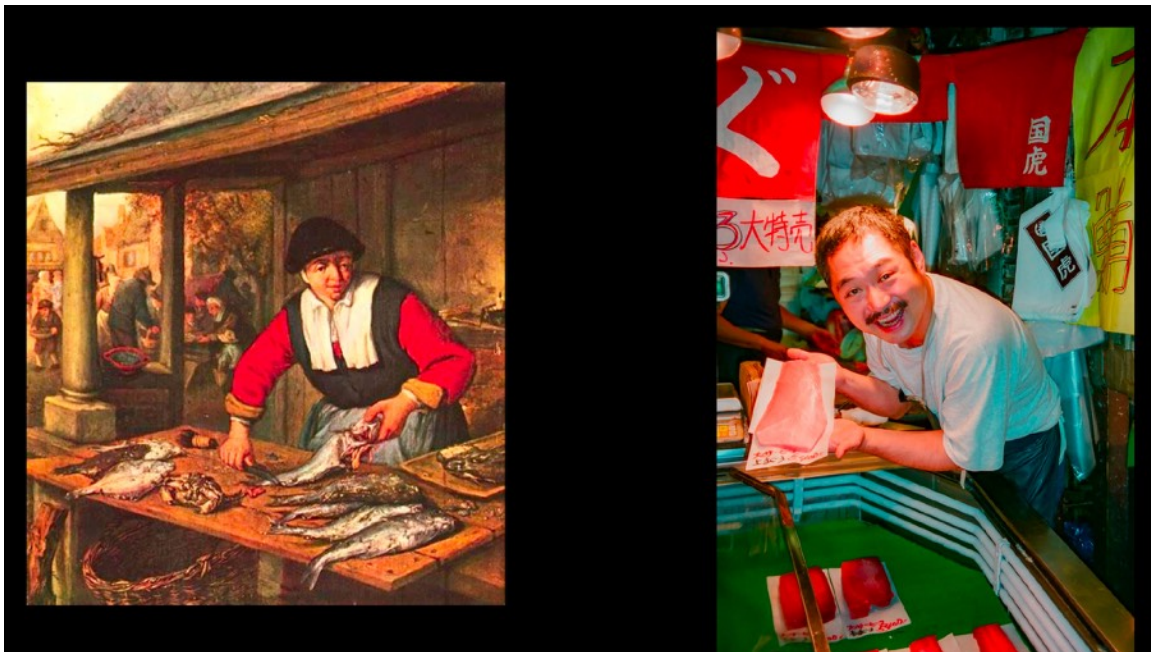
The Fishwife, Adriaen van Ostade (1610–1685) -- Japanese Fish Monger