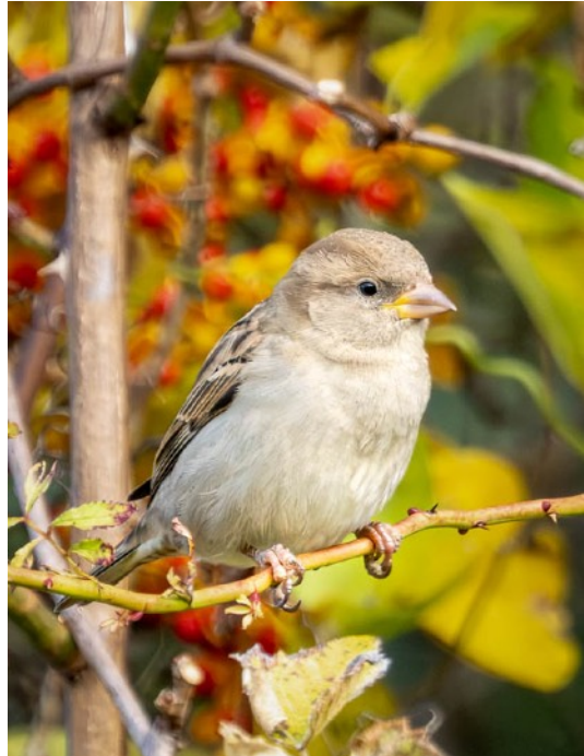
Sitting Pretty