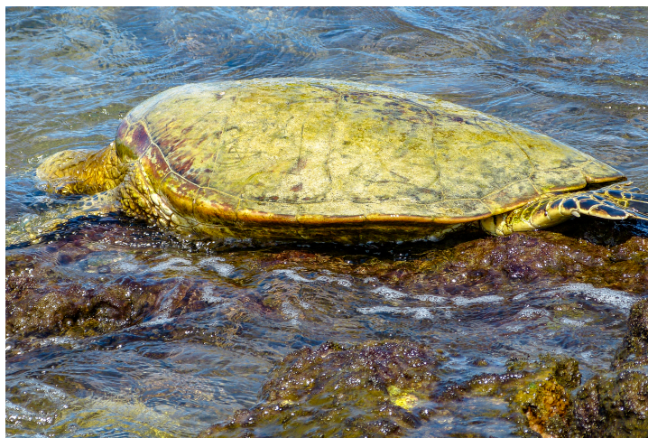
Sea Turtle, Hawaii