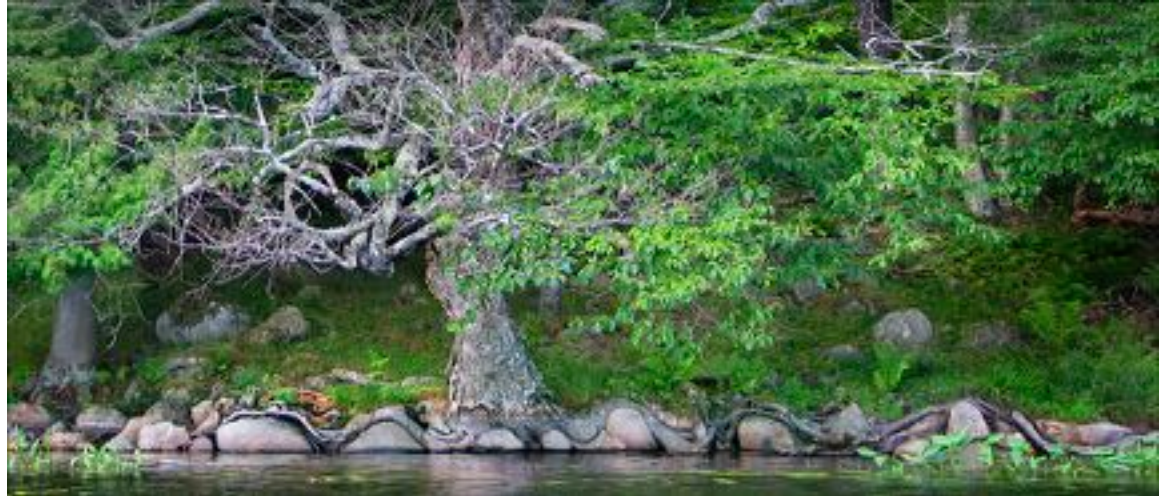
Undulations